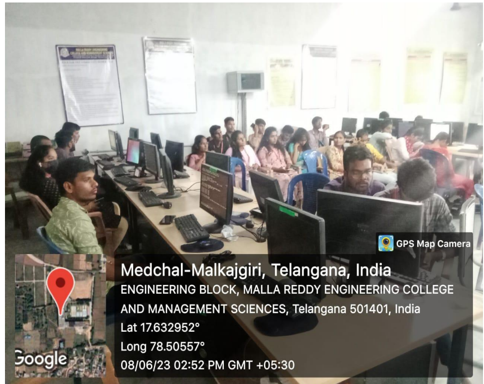
Career Guidance Talk under IETE SF