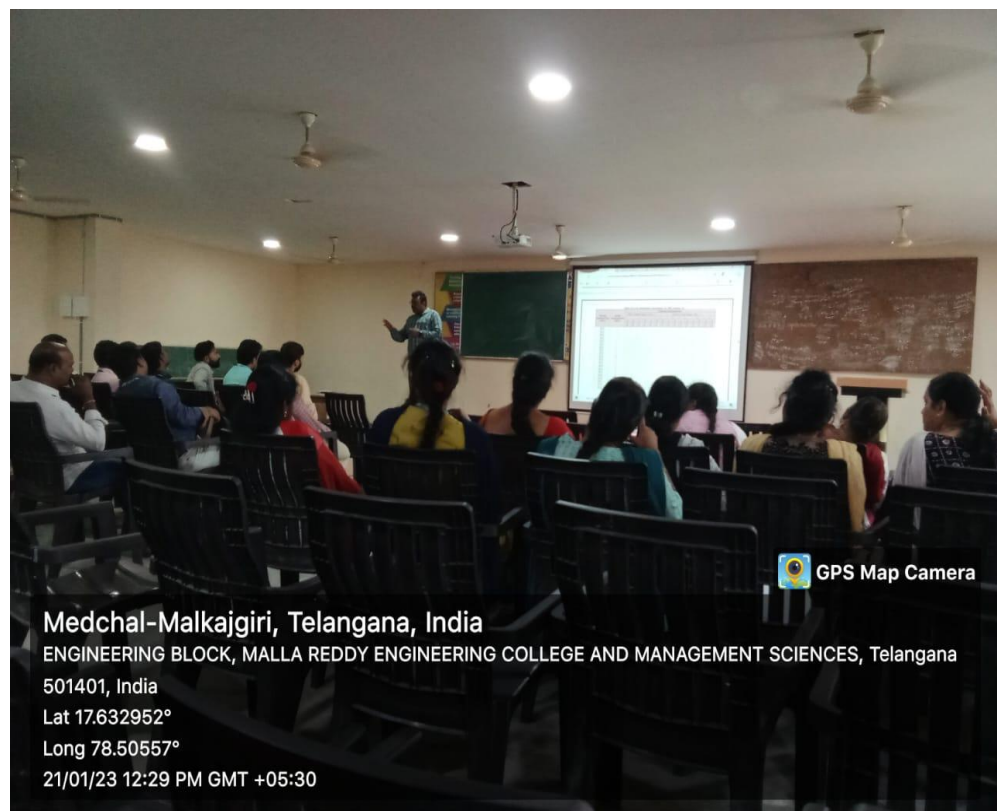
Fig no:4.6.1.5Expert Talk on Trends in Electric and Autonomous Vehicles under IETE SF